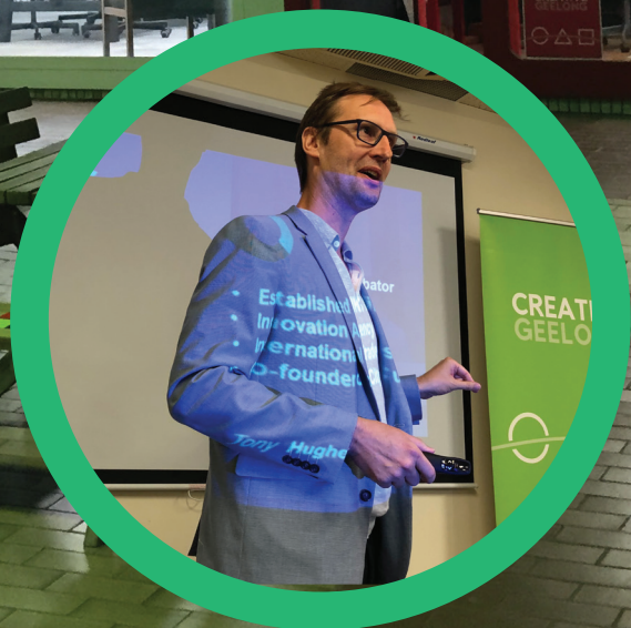
Range of photos from the Makers Hub