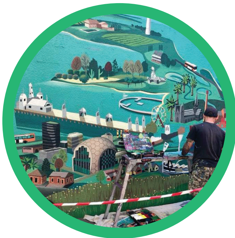
Mural on Market Square Shopping Centre, Little Malop Street, Geelong

Creative Industries are enabled by digital technology and access to the internet. The digital economy is impacting on how we work, live, learn and communicate and the creative industries need to be recognised as a genuine economic cluster and gain support through local strategic planning.